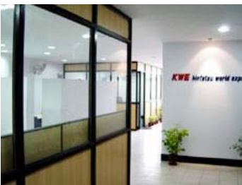
KWE Bangalore – India HQ