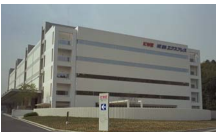
KWE Baraki Terminal

KWE Japan's Logistics Department launched the project team immediately following the enforcement of the revised Medical Act. In obtaining these licenses, KWE will be able to meet the various needs of our medical and cosmetics customer and provide them with highly qualified services. Furthermore, by achieving ISO 13485, KWE Japan aims to enhance customer satisfaction and quality by serving as a "one-stop service" from import to distribution.