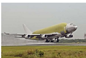
Boeing 747-400 LCF

Last month, the first of three Boeing 747-400 Large Cargo Freighters (LCF) was unveiled at Taipei's Chiang Kai-Shek International Airport. The LCF is a specially designed 747 freighter which will be used to transport assemblies for the new Boeing 787 Dreamliner aircraft. The modifications were performed by Evergreen Aviation Technologies (EGAT), a joint venture of EVA Air and General Electric and a part of Taiwan's Evergreen Group.