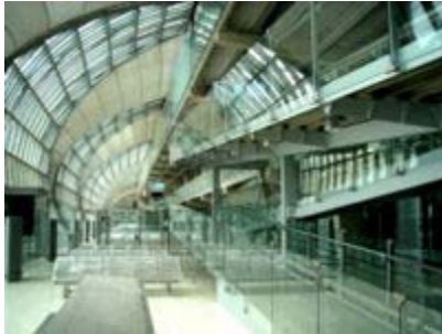
New Bangkok International Airport

With any airport transition of this size, delays and operational interruptions are possible. KWE Thailand has been working very closely with government and airport officials as well as key carriers to prepare for the shift. At this time, neither Thai Customs nor the Thailand Airport Authority has provided any final directives or instructions with regards to operational activity to, from or within the new airport.