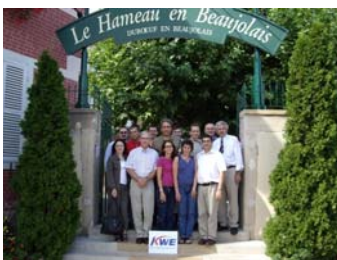
KWE France Mgmt Team at Georges Duboeuf

KWE has been recognized as an outstanding supplier by the Beaujolais committee. This year KWE France is pleased to again be able to deliver Beaujolais Nouveau to the Japanese market for the opening day in November. To provide this service, KWE France works very closely with KWE Japan (U303) sales office.