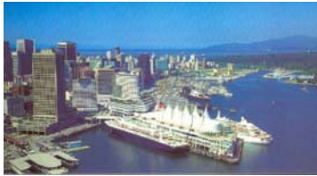
Port of Vancouver