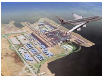
Rendering of Doha Airport

The Doha Airport Cargo Terminal has been completely congested for the past eight weeks. In order to clear this backlog, the ground handling agent, Qatar Aviation Services, an affiliate of Qatar Airways, is imposing various restrictions; including limitations on consolidated shipments. Additionally, high storage charges are being levied as of October 10. To avoid any delays or extra fees, KWE export operations teams will not be offering any consolidations to Doha for the time being. For urgent or priority shipments, KWE is investigating alternate routing options via Dubai.