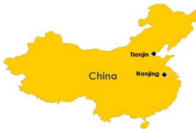
KWE China New Locations

The addition of these two new facilities further demonstrates KWE's commitment to expanding our network and service offering in China.