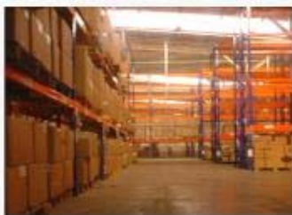
KWE South Africa Warehouse

By freeing-up this capital, as well as through KWE freight cost containment and reduction efforts, SAA has been able to invest in other far more productive areas. It is worthwhile to note that service quality has been maintained and increased during the cost containment and productivity initiatives implemented by KWE SA, evidenced by 100% stock-availability throughout these programs.